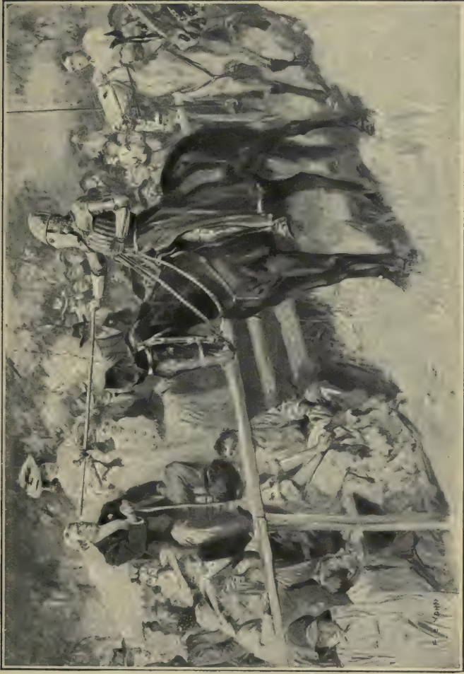
The Knight of the Cumberland reined in before the Blight.